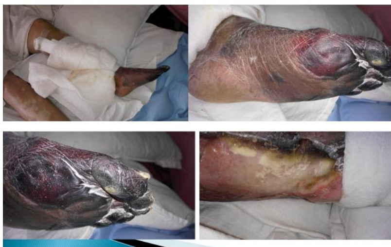
Photographs of affected area ( left foot) before Cellsonic VIPP treatment :

To cure the gangrene CellSonic would have to cause increased vascularisation, kill any infection and restore failed nerves. Well documented results on wound healing in Germany confirmed that this is all possible.