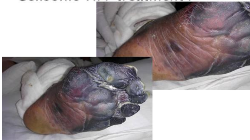
Photographs of affected area ( left foot) after 1 st Session of Cellsonic VIPP treatment :