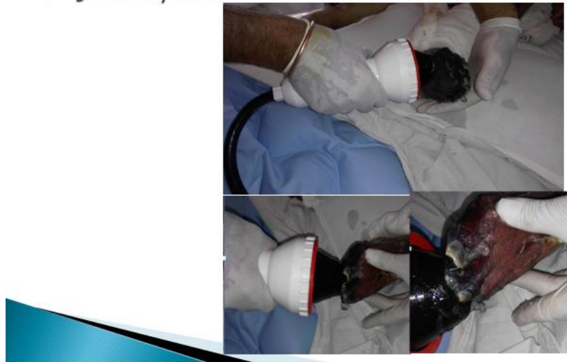
Photographs of affected area (left foot) after 1 st Session of Cellsonic VIPP treatment :